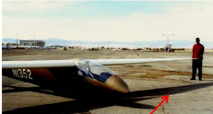
Ready to Start Tow