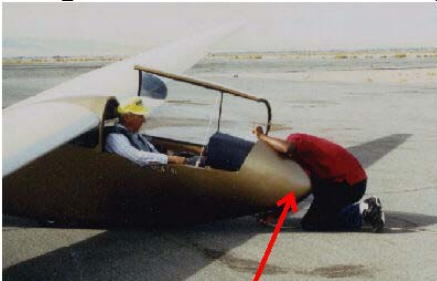
Hooking Up Tow Line