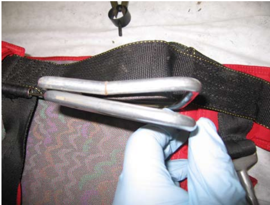
Figure 2 'D' ring distortion