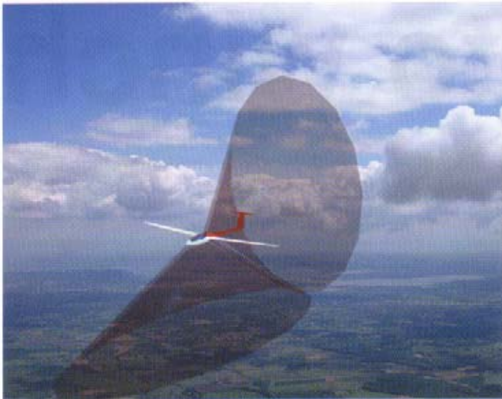
Above: be aware of these two blind spots for the glider pilot. Left: Neil Lawson and (front) Al Greensmith in Lasham's Grob Twin Acro III