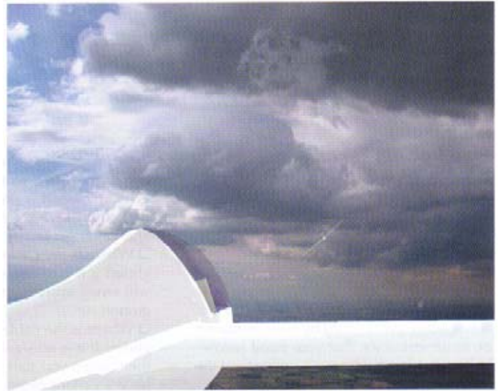
Note the position of the thermalling glider's tail against a point on the horizon; this should be the extent of its turn

FOR SOME years now, soaring pilots have found it beneficial to fly in pairs, and the recent results of our gliding teams have proved this to be a highly effective tactic. There are several reasons for this, one of which is the fact that two gliders flying in a co-operative manner will almost always centre a thermal faster and subsequently outclimb an individual.